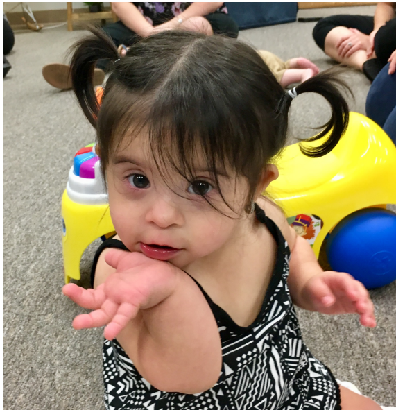
Families at GiGi's Playhouse

"We will be with them every step of the way. To be a part of a community that truly believes in your child is life changing."