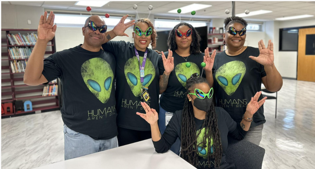
Benjamin Stoddert Middle School