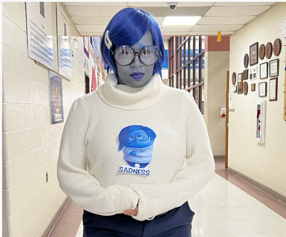
Bladensburg Elementary School

Teachers and staff were busy this week encouraging a love of reading, creativity and imagination during character days and storybook parades!