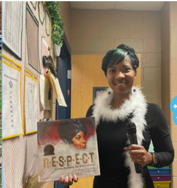
Greenbelt Elementary School