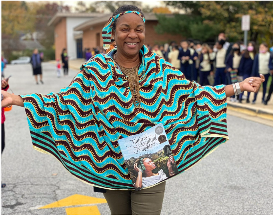
Lamont Elementary School