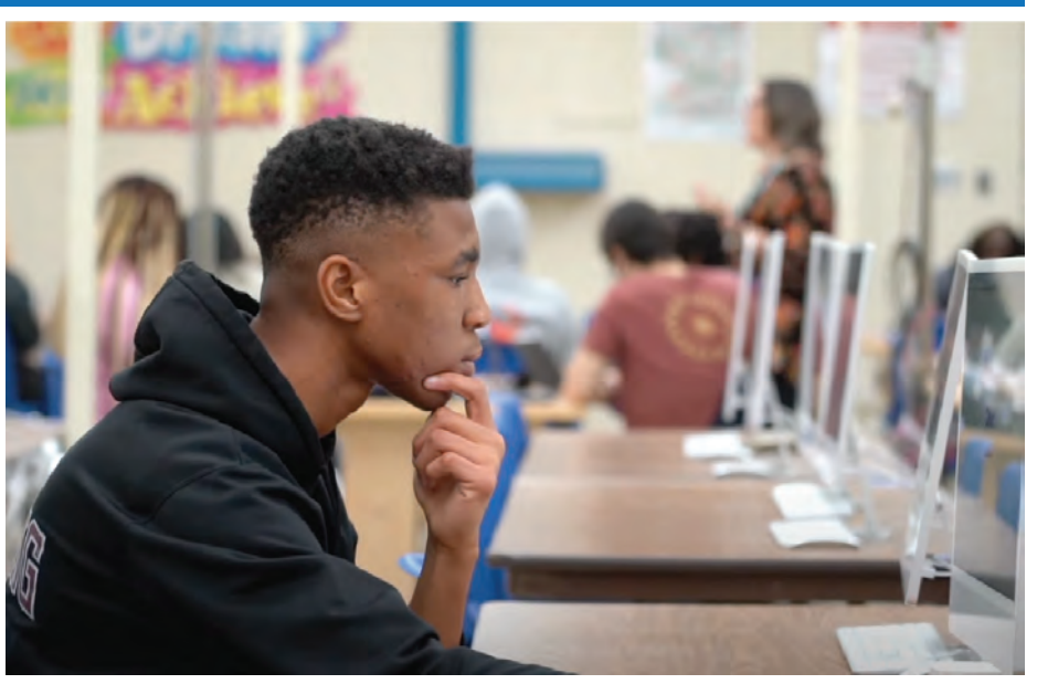
Watch the Video To learn More

PGCPS and the Department of Creative and Performing Arts is pleased to announce it has been recognized as an Apple Distinguished School for the 2023–2026 program term for its innovative program called Project: Creativity. This program currently resides in 23 high schools and was selected for this distinction based on its commitment to continuous innovation in education and using Apple products to create exemplary learning practices.