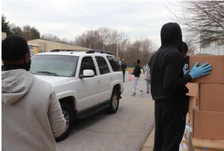
(Above): Volunteers at Charles Herbert Flowers High School distribute food at our recent Grab & Go event with Food4Thought .

The season of giving continues all month as we distribute food to families in need through our Grab & Go meal distribution events in partnership with Food4Thought on Saturday, Dec. 19. Collectively, Food4Thought has distributed more than 900 boxes of food to our students and school communities.