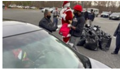
Photo: Prince George's County Police Department distributing backpacks and gifts during drive-through event.

We are grateful for the Prince George's County Police Department who remained determined to support our students through this great event, in the midst of the COVID-19 global pandemic.